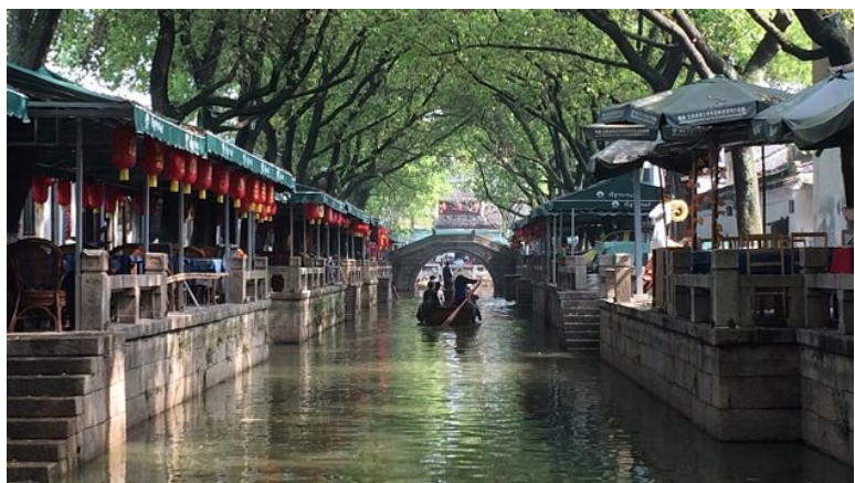
>> Suzhou on the Grand Canal