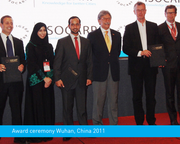
Award ceremony Wuhan, China 2011