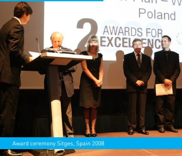
Award ceremony Sitges, Spain 2008