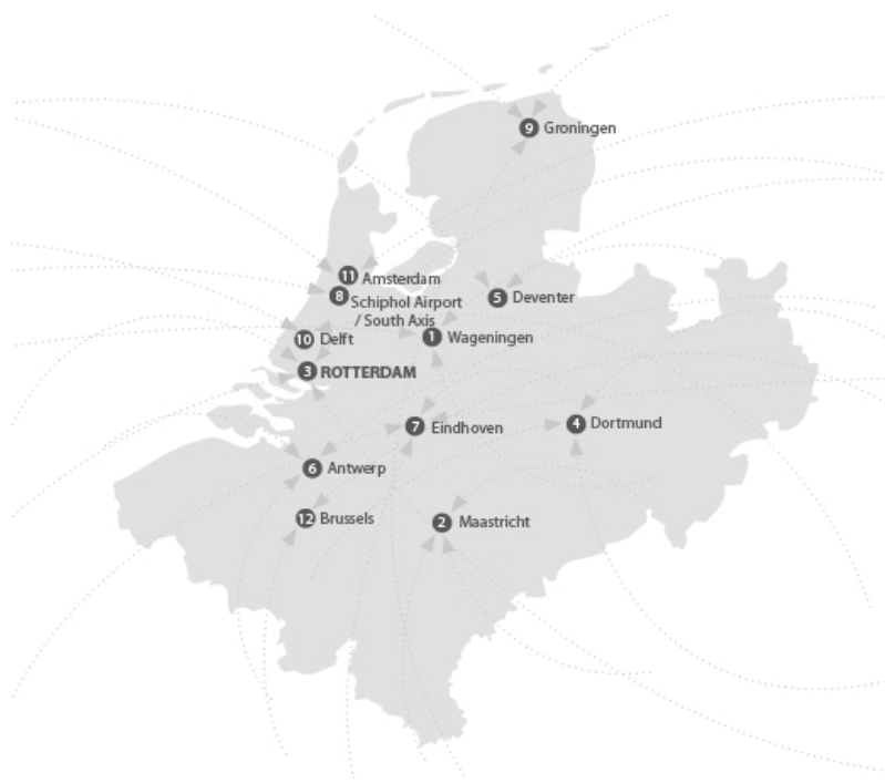
ISOCARP 2015 congress: location of 12 workshop cities

> How to harness human resources for development under austerity?