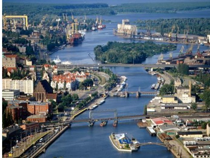
Szczecin natural and cultural heritage