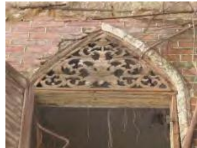
Old façades to be preserved in the downtown Centre of Shantou