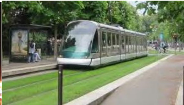
Shantou Centre to be protected and Modern transportation within the Centre