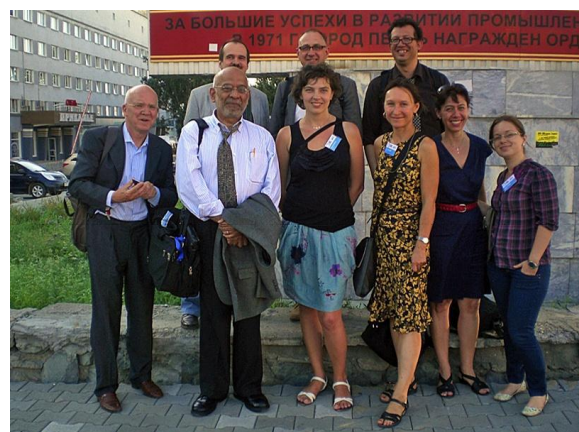
Cultural heritage integrated in a knowledge hub and team in Perm

By the way, the Perm Universities (including all actors involved in knowledge issues, academies, research centres...) will have a role to play in involving young people, providing content, design, network and financial resources.