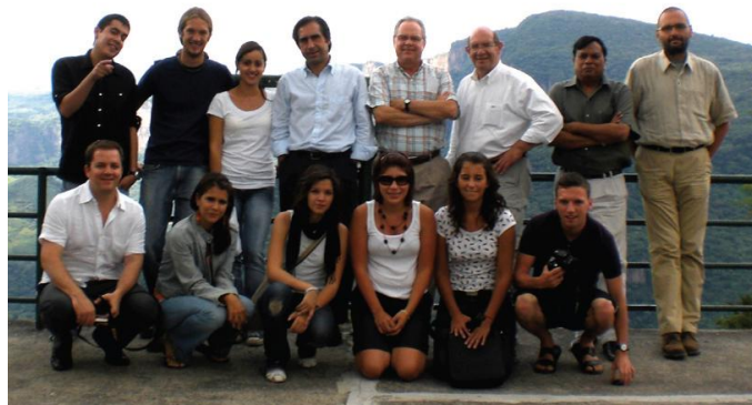
International team of senior and young planners

Associating young urban planners from all parts of the world, in the daily life of the NGO, is a basic aim for ISOCARP. So, they can exchange ideas, methods and experiences relating to the global issues, such as a lack of education on the safeguarding of cultural heritage when acting on urban development. Every participant in these seminars or workshops can benefit from the experience of senior ISOCARP members and share with young planners from other regions. A few relevant examples will follow to be more concrete on the matter.