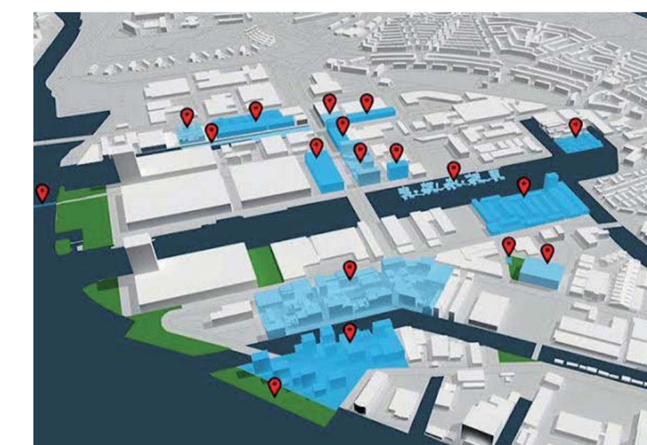
OPEN DEVELOPMENT BUIKSLOTERHAM - AMSTERDAM