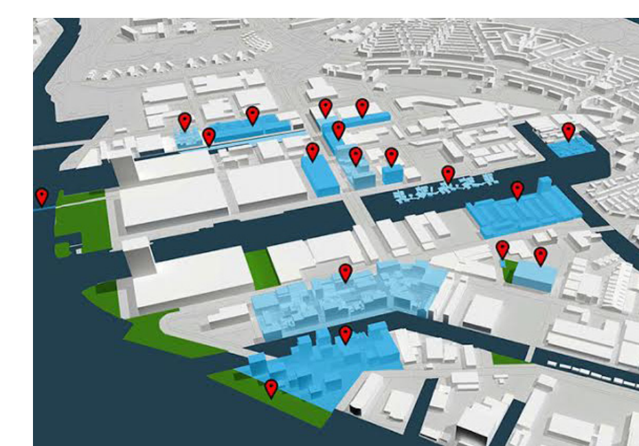
OPEN DEVELOPMENT BUIKSLOTERHAM - AMSTERDAM