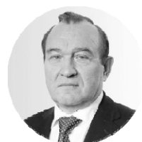
P. Biryukov Deputy Mayor for Housing, Utilities and Amenities