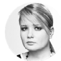
N. Sergunina Deputy Mayor for Economic Policy and Property and Land Relations