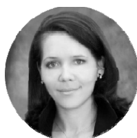
A. Rakova Deputy Mayor, Chief of Staff to the Mayor and Moscow Government