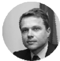
M. Lukstutov Deputy Mayor and Head of the Department of Transport and Road Infrastructure Development