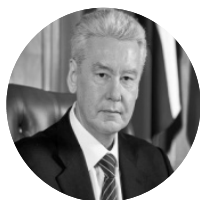
S. Sobyenin Mayor of Moscow