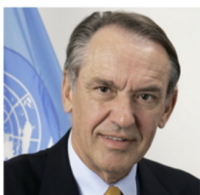
Jan Eliasson Former President of the United Nations General Assembly