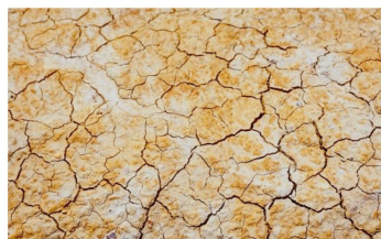
Managing uncertain futures