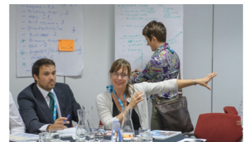
Communication and citizen engagement