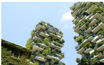
Water sensitive urban design for resilient cities