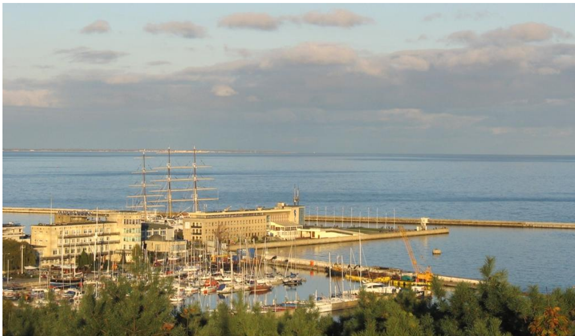
Figure 2: View of Gdynia's marina with South Pier in the background