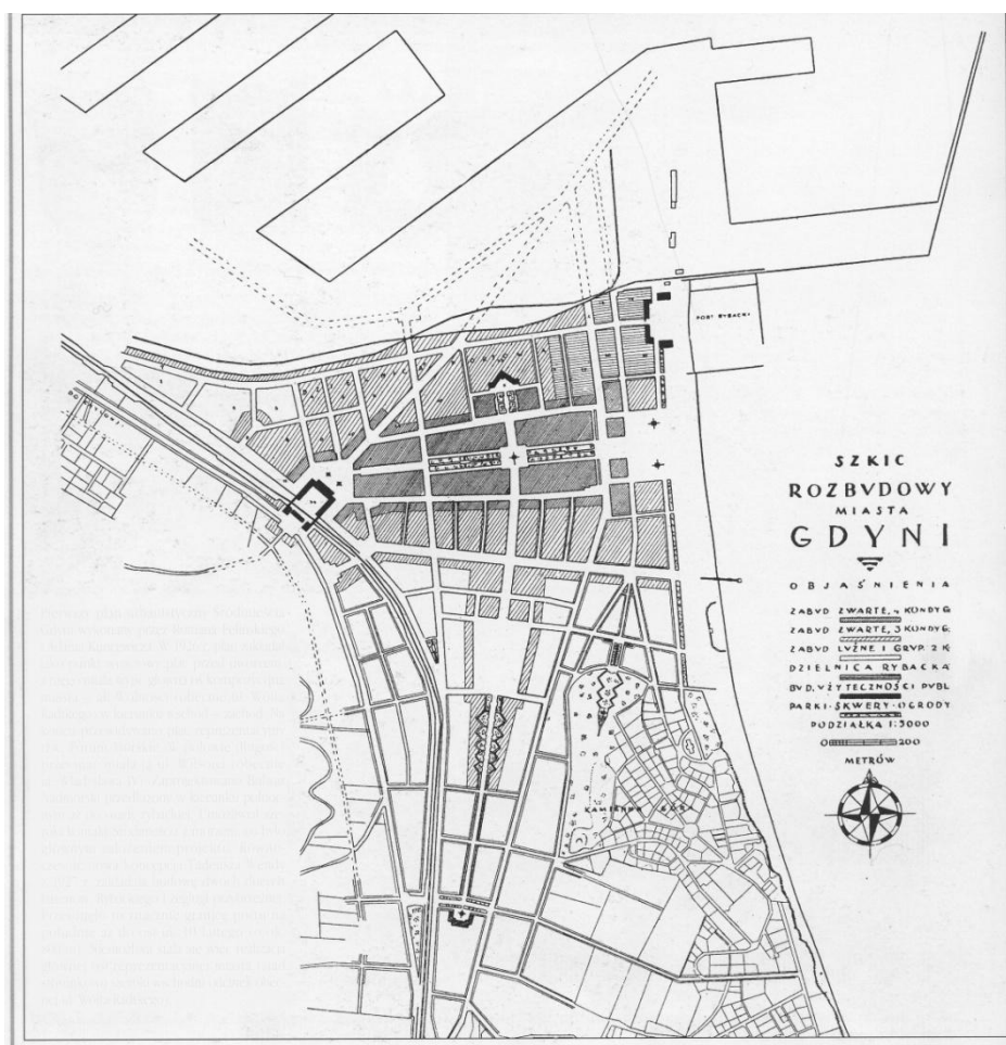
Figure 1: Plan of Gdynia City from 1926 r.

During the development phase the original plan underwent many modifications. Faster than expected development of the Port area devoured plots where the northern quarters of Downtown were planned. The axis leading from the train station along the street Starowiejskiej was seized by port functions. Plan established in 1930 adjusts the structure of the city to this situation. Kościuszki Square leading to South Pier became main axis of the city.