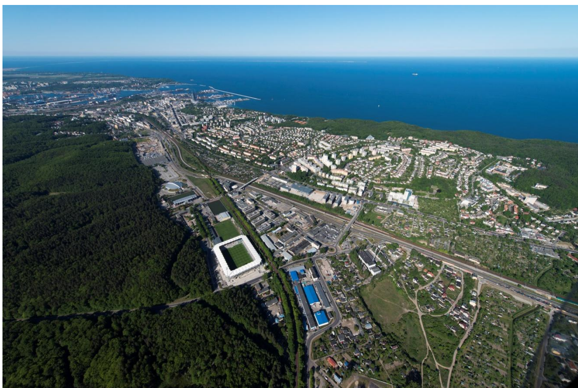
Figure 3: Aerial photo of Gdynia