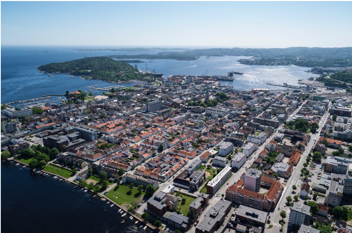
Kristiansand

Kristiansand is the administrative, business and cultural capital of Southern Norway. Nicknamed ‘the coolest Riviera’ by the media, it is a modern city with a cosmopolitan history. A leading light in the technology sector and number one in exports, the Kristiansand region is one of the fastest growing regions in Scandinavia and the fastest growing region in Norway. With a population of 137,000, the region comprises the municipalities of Søgne, Songdalen, Iveland, Vennesla, Birkenes, Lillesand and Kristiansand. Surrounded by picturesque scenery - from tiny rocky islands in the fjords to snow-covered mountains inland – Kristiansand offers a rich variety of recreational activities. Flourishing businesses around Kristiansand attract engineers and professionals from the University of Agder and other educational institutions within the city. Some of the largest companies are energybased, either as suppliers to the oil industry or as producers of or suppliers to the emerging renewable energy market. The geographical proximity to the hub of the European continent, nature and the wide range of cultural activities is making the region an attractive place to live. Kristiansand is brimming with exciting opportunities, both professional and recreational. Kristiansand is the gateway for more than two million travellers each year.