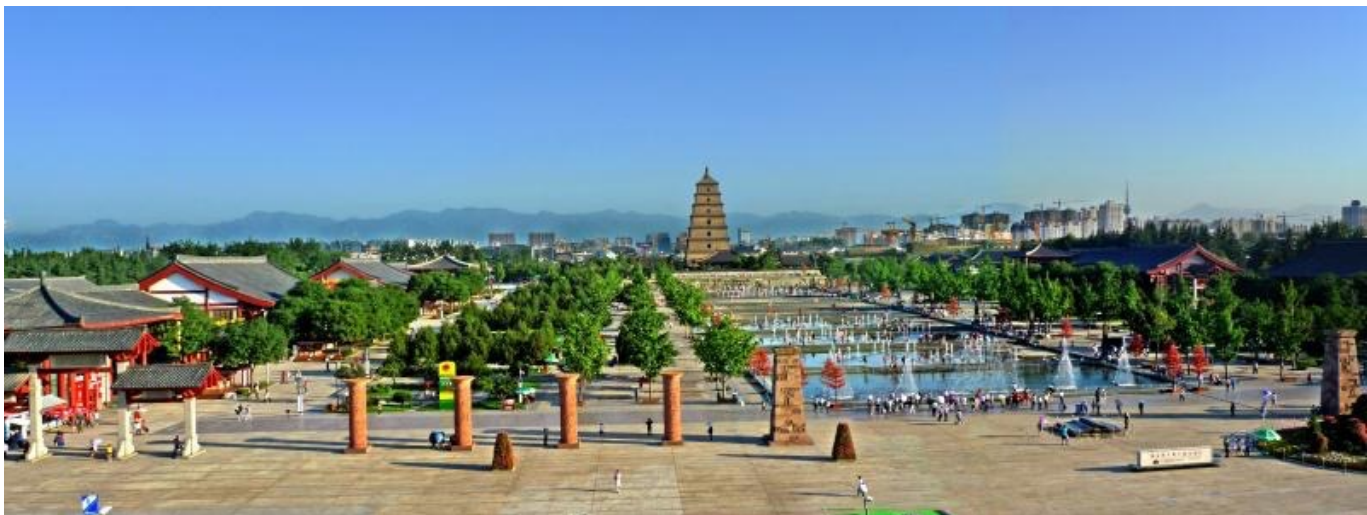
Xi'an By UPSC

In February 2018, the National Development and Reform Commission of the Ministry of Housing and Urban-Rural Development released the development plan of urban agglomeration in Guanzhong plain, which supports the construction of national center city, international comprehensive transport hub in Xi'an and promotes Xi'an to build the international metropolis while protecting its historical and cultural values.