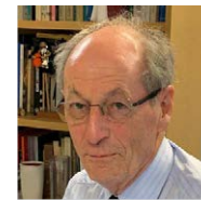
Sir Michael Marmot Professor, director of the Institute of Health Equity (UCL Department of Epidemiology & Public Health), UK