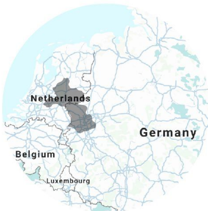
Figure 1 The Dutch-German cross-border region (Haxhija, 2018)

Both countries work with common supranational European legal and institutional framework when it comes to water and environmental related issues (e.g. Water Framework Directive). Despite this, in reality, cross-border water policy in the area faces noticeable disparities from one side of the border to the other, due to different planning modes, different priorities in their respective territorial agenda and different legal and political conditions. For instance, as mentioned by several interested actors there are different norms and rules when it comes to water quality.