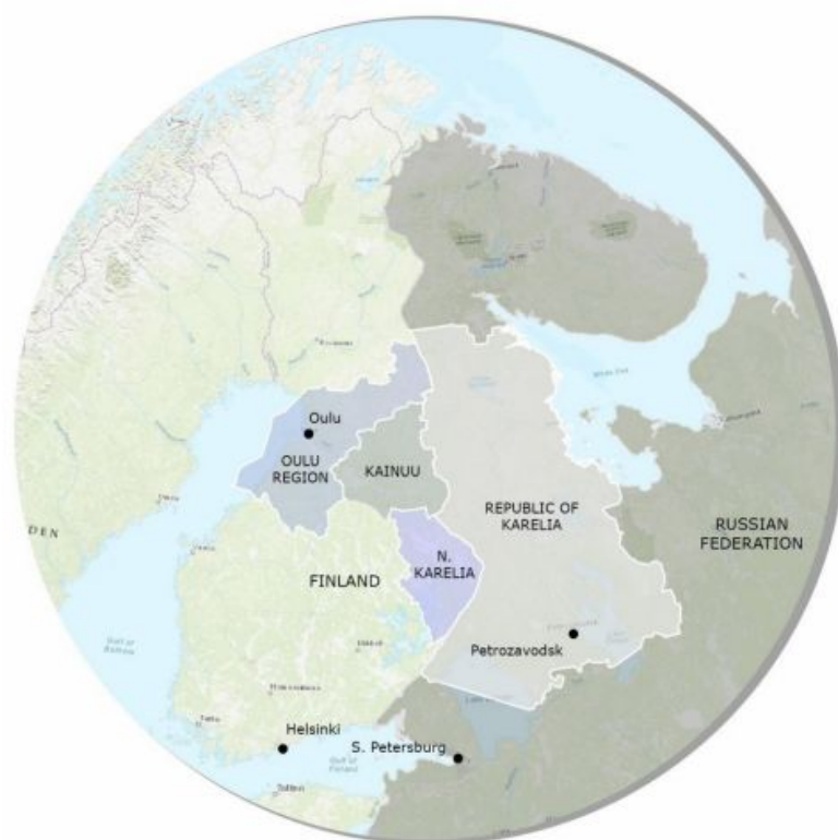
Figure 2 The Karelia CBC programme region (Carius de Barros, 2018)

The Karelia CBC programme area include the regions of Oulu, North Karelia and Kainuu in Finland, and the Republic of Karelia in Russia (Figure 2). With three crossing points, the 700 km long border counts with 1.3 million inhabitants in low dense, sparsely populated areas (DG NEAR, 2018). Cooperation in the region is ongoing since the first EU programmes of TACIS and INTERREG, and continues today under the ENPI framework.