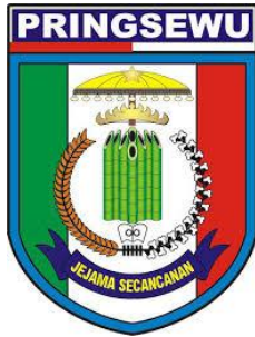
Figure 2 The Logo and Slogan of Pringsewu

brand identity in order to create a competitive advantage that will be recognized by global market, meaning of the city have a perception and basic knowledge of how the city.