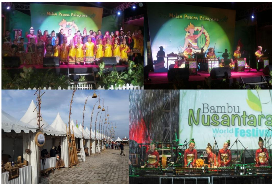
Figure 4 Cultural Events in Pringsewu

Supporting cultural industries in Lampung Province, Pringsewu is chosen being host for the 8th and 9th Bambu Nusantara Festivals which is annual international events of Economic Creative and Tourism Ministry (Figure 4). It was held from May 15th to 16th 2014 and then in November 29th - 30 th 2015 at Pringsewu Government Field. Events is opened to all typo of performance including folk dance, folk music, traditional dance group, modern dance and traditional icon culinary. This festival features various product and attractions to develop and highlight bamboo as local potenciales of Pringsewu identity. The cultural festivals attract culture tourist to local community events, it have contributed in the development of cultural tourism. Festivals have major impacts to promote the local potenciales and the host communities. The local government as well private sectors and society in general have responsibility for tourism development and promotion to global market.