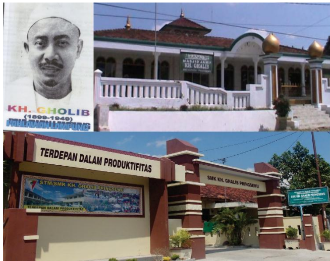
Figure 1 K.H Ghalib Jami Mosque and Pesantren in Pringsewu