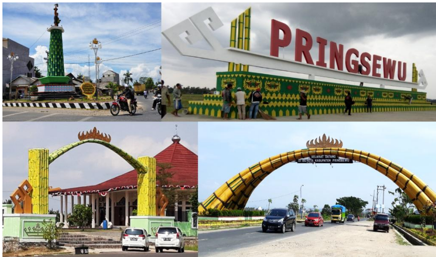
Figure 3 The Monument Signs in Pringsewu

Landmark was designed as statements of the city branding in architectural to generate enormous public interest. Such building have become brands in their own right and being a communication media to provides the city vision and development strategies. Landmark is used to reflect the consistency of the visual appearance for the government to strengthen the city branding. There are monument signs in Pringsewu describe a symbols of bamboo philosophy despite it was not made of the real bamboo material (Figure 3). Based on concepts and design, it was unfunctional building and lacking to being a successful attributes to provides "bamboo city" brand. Nothing building construction and designed provides bamboo as a building material. Bamboo as a building material has high compressive strength, low weight, renewable, extremely versatile and sustain in those locations where it is found in abundance. Bamboo material is used for the construction such scaffolding, structures, householding even high level building. It is one of the fastest growing plants than most other species of plants, which is conventionally suitable cultivated in Southeast Asia. Generally the landmark for "bamboo city" brand was lacking in innovative branding features.