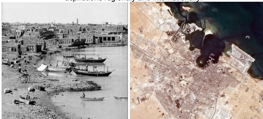
Figure 4&5: Doha's Evolution from a humble traditional settlement to a metropolitan urbanity (Source: MME).