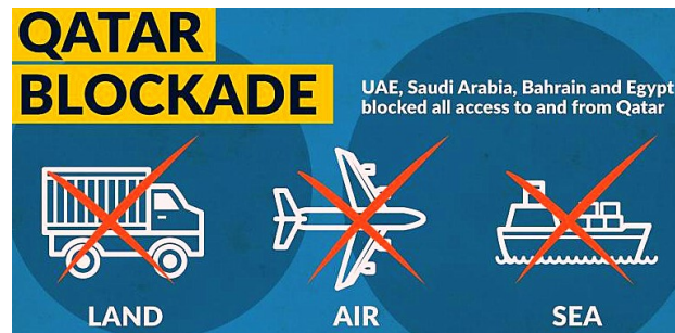
Figure 11: On the 5 th June 2018, Qatar's neighbors imposed an unprecedented blockade against the whole State.

One of the major forces which led to unprecedented challenge for Doha and Qatar as a whole is the blockade imposed by its close neighbors. The blockade as the paper illustrates opened new dimensions in the city's acknowledgment and comprehension of resilience. Ironically and surprisingly, in the 50 anniversary of the six days war in 1967 where Arab armies were humiliated and defeated, four Arab States decided to activate an unprecedented sea, air and land blockade against Qatar. The whole Middle East and the world wake up on the fifth of June 2017 reading the news about the decisions imposed by Saudi Arabia, United Arab of Emirates, Bahrain and Egypt on their neighbor and founding member of the Gulf Cooperation Council (GCC), Qatar. Pressure mounted further after relations with its regional neighbors hit rock bottom last June. Since then, Saudi Arabia has led a boycott of Qatar, with full participation from Bahrain, the UAE and Egypt. Planes have been prohibited from flying to Doha, banks from dealing with Qatari banks, and the country's influential satellite TV channel, Al-Jazeera, remains off the airwaves throughout most of the Arab World.