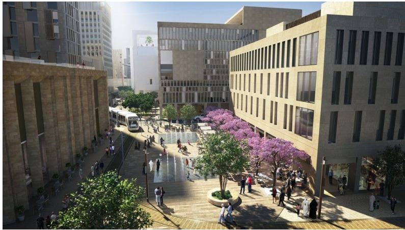
Figure 7: The post-oil urbanism suggests a paradigm shift towards walkability and transit oriented development in Doha.