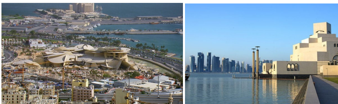
Figure 8&9: The new cultural districts help Doha in establishing a new form of Knowledge-based Urban Development (KBUD).

With increasing awareness about the carbon emissions and the negative impacts of climate change, the paper evaluates Doha's attempt to transform its urban movement pattern from purely car-dependent city to a model for a transit-oriented development with the vitalization of connected network of public transportation, pedestrian streets and bicycle routes. Doha's model of urban resilience as reflected in the city's masterplan is answering the fundamental question of how to design and operate the city so it can withstand major threats and how to recover from them? Yamagata and Maruyama (2016) argue that land-use planning and