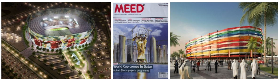
Figure 10: Doha is balancing hosting the 2022 FIFA World Cup with the future aspirations of the city.

Qatar is consciously aware of the day after oil and is using the unprecedented opportunity of hosting the 2022 FIFA world cup as an engine to inspire a new blueprint for the future of its people and cities (Nadine, 2014). The strategic thinking transformation towards how to host a global sports event in Qatar resulted in a new blueprint and a road map. This blueprint was based on a number of integrated aspects. All of which were designed and assembled in a way to guarantee that the process of hosting the event will be successful not only during the thirty days of the competitions but for decades to come. Qatar has been using sports strategically as a foreign policy tool that contributes to national security and allows the country to gain soft power. Even on the level of enhancing the global image after the blockade, Qatar smartly used sports to deliver a positive message about its stability and commitment to global investment. Current evidences particularly during the events of the 2018 FIFA world cup in Russia and the excellent presence of Qatar suggests that The 2022 World Cup in Qatar will happen, although not everybody might like that. As explained earlier,