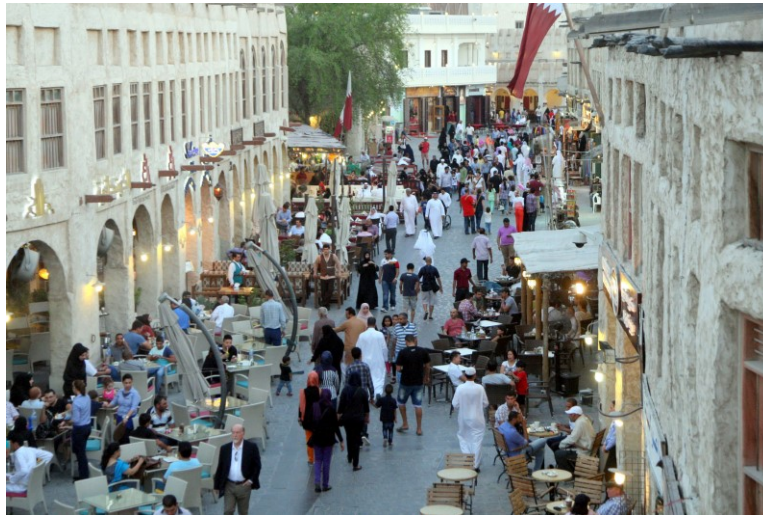
Figure 12: The city spaces are planned to accommodate the different social groups and emphasize the social cohesion.

The city is taking a number of measures to create better connections between expatriates and the city significantly sense of belonging and ownership which would radically help in inspiring the city's overall population of locals and expatriated to better defend the city and take a solidifying position towards realizing its future aspirations. The paper concludes with articulating a more holistic framework for city resilience which takes into consideration the multifaceted nature of the city and better prepare it for different forms of changes and transformations which might occur in the future. Coaffee and Lee (2017) examine how the concepts and principles of resilience exert increasing significant influence over the form and function of planning. Their discussion of the 'politics of resilience' in which fundamental questions of social and spatial justice are posed is relevant to the notion of social cohesion in Doha after activating the blockade.