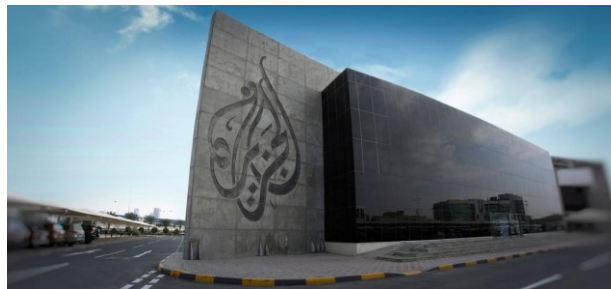
Figure 3: Al Jazeera News Network is one of the most effective tools for Qatar's plan to achieve big aspirations regionally and internationally.