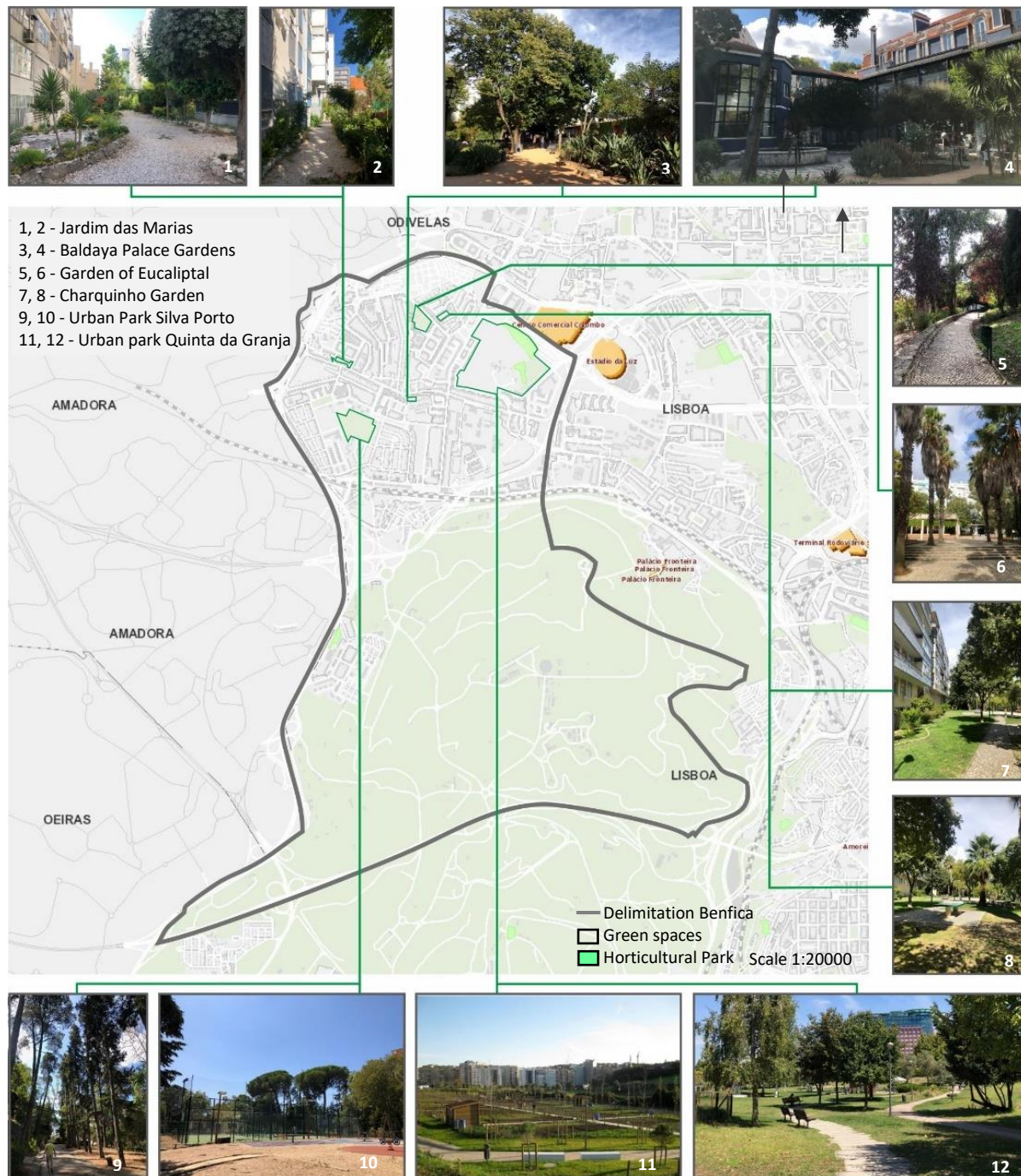
Figure 2: UGS Identification.

The current supply of the Benfica UGS was analysed according to the existing situation in the total Benfica area, based on the following parameters: i) the spatial identification of green spaces (Fig 2), ii) the minimum requirements of green space area per inhabitant, as presented above and presented below (Tab 4).