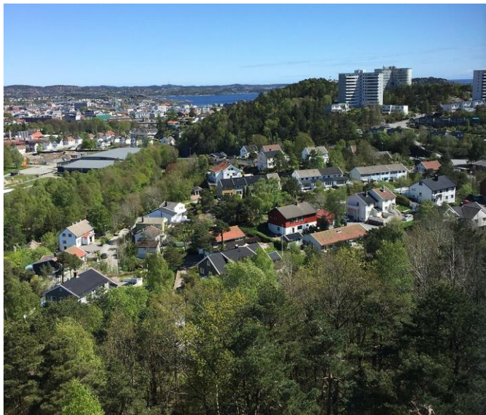
Figure 1. District of Tinnheia in Kristiansand, Norway from above.

The research activity of SOSLOKAL project in Tinnheia is being carried out at the same time as a feasibility study carried out by Kristiansand Municipality's city planning department together with the local community. The feasibility study explores what can be done to upgrade the area. The application of the Place Standard Tool in Tinnheia aims at mobilizing residents to participate in local development processes as well as providing input on social sustainability and potential improvements in the area.