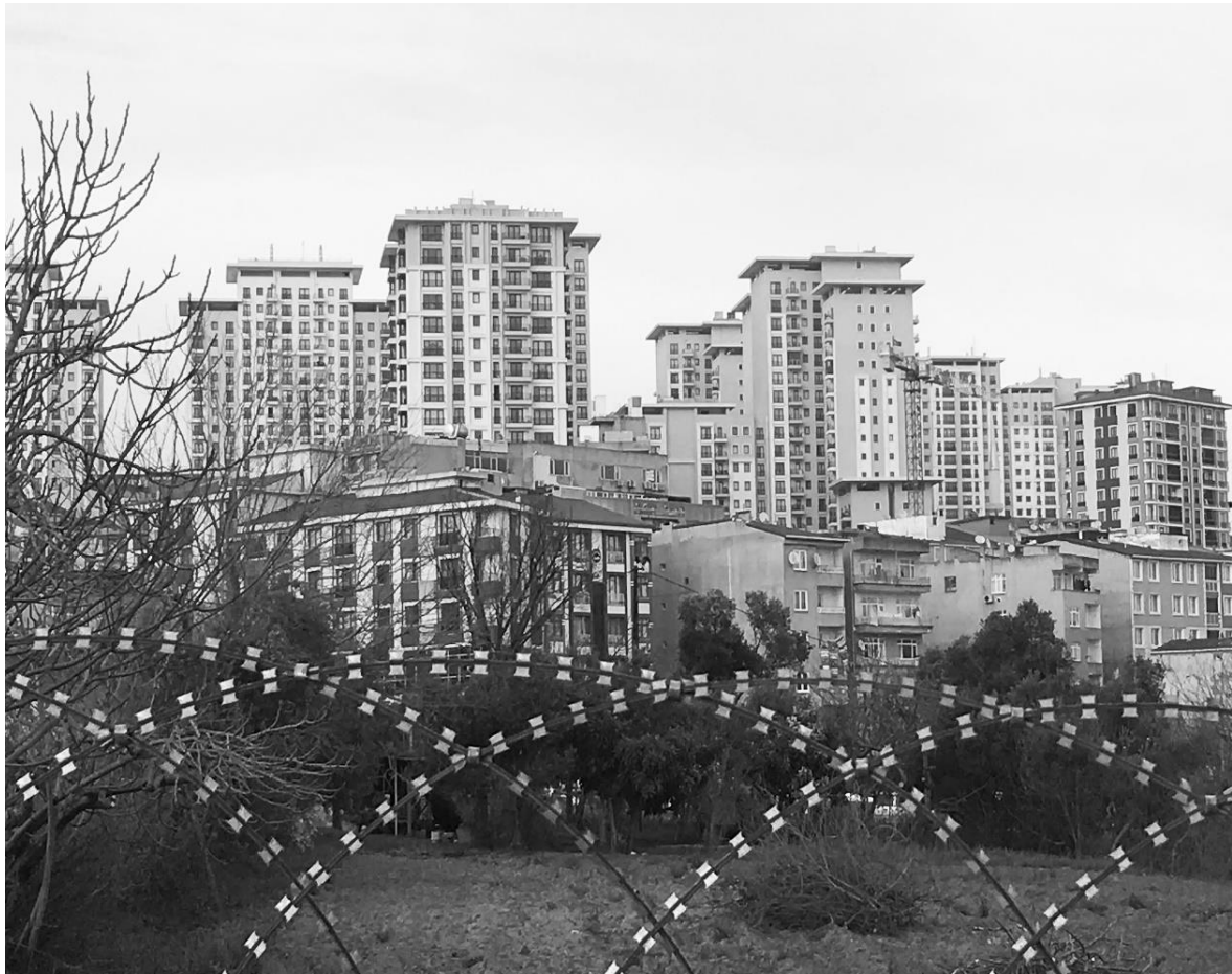
Figure 3 The transforming frame of the space in Esenler Havaalanı Neighborhood.

It was a very difficult process, we do not know where and how we will live, and we do not know when and how our house will be completed. Can you imagine the desperation? As everyone in the neighborhood is looking for a house at the same time, rents have also increased. Nobody wanted to move away from where they live. So, I want it to be seen how we suffered and disappointed. (Şenay, Personal Interview, 12.05.2018).