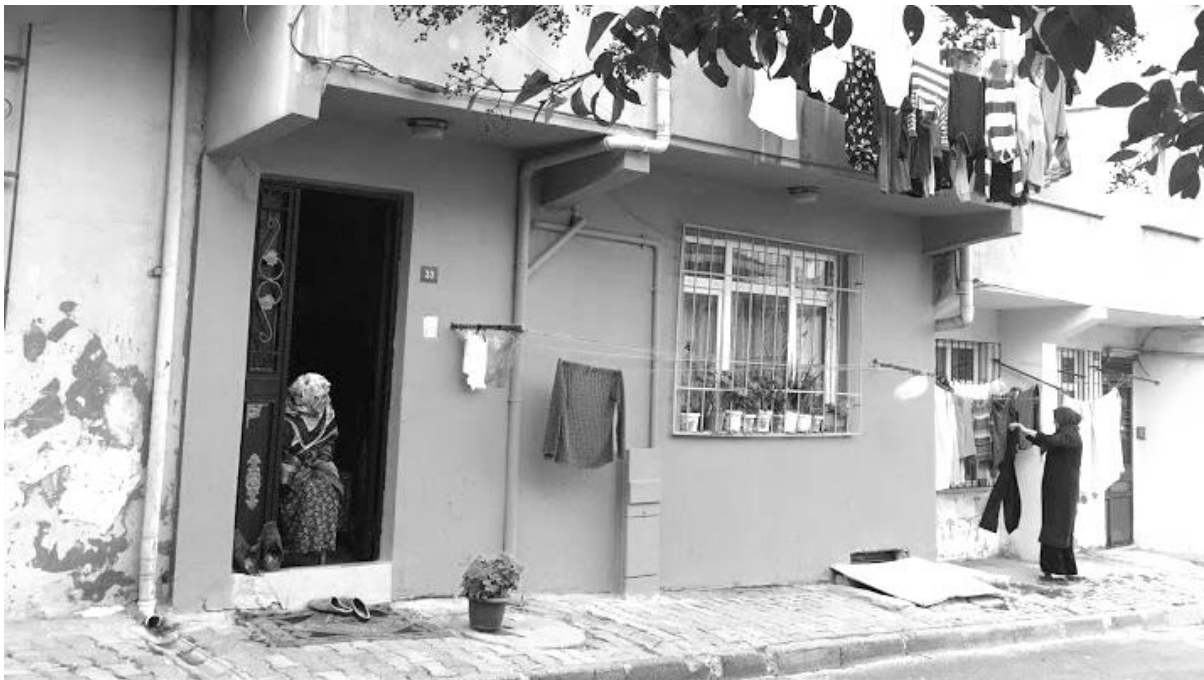
Figure 4 Esenler Havaalanı Neighborhood, old neighborhood life.

This emerging alienation causes intolerance in the new society structure Atilla explains this situation; 'Our neighborhood was our family' . Each of the interviewees talks about the lack of sense of belonging both in the houses they rent out and the site they live in. All of them emphasize that they feel 'in a closed box' in a high-rise complex while living in a family apartment, a neighborhood unit. Even when talking about the increasing number of facilities the interviewees emphasized that the main problem was to be individualized.