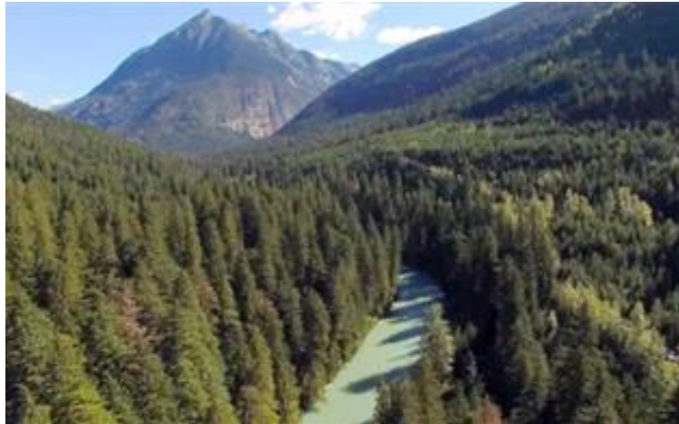
Figure 2. The Incomappleux Valley in British Columbia, Canada remains not-urban.