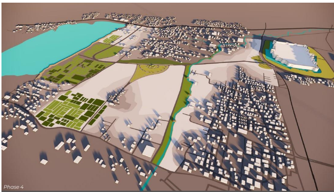
Figure 8. Peri-city Urban TransformNation Project. Sittroor. This project intends functional and infrastructure elements for wider Vellore along with maintaining farming on the southwest. Housing is infill with a variety of density that increases over time. Source. V-SPARC Students: Smeja Shelly Deborah, Chinnambeti Dhedeeppya, Bharanishri Gujuluva, Lalitha Bhai Jagadeesan, Edara Yugesh.

The studio outcomes serve as an impression of what kind of development is possible.