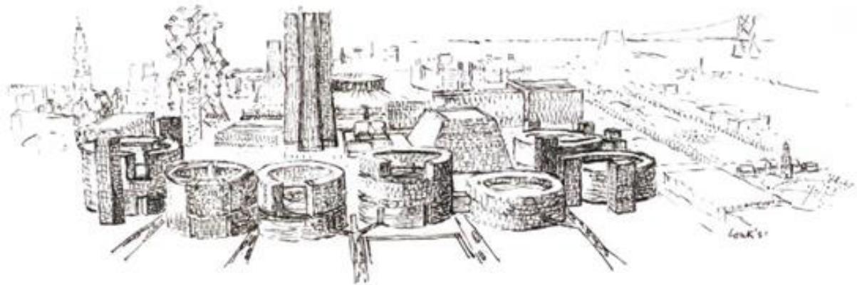
Figure 7. Urban planning and design with an architectural outcome. Louis I. Kahn. 'Civic Center, Project, Philadelphia, Pennsylvania. Source: c. 1957. Digital image © The Museum of Modern Art, New York. Licensed by sCala/art resource, New York.

paper on Kahn's plan and Bacon's plan and opposition brings us to the threshold of the essential quality that keeps us building inequality. (Arkarapasertkul 2008) See Figure 7.