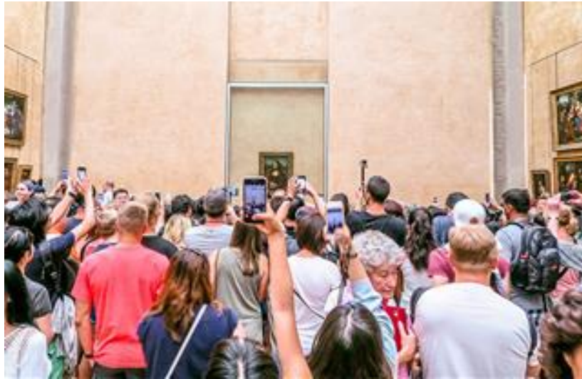
Figure 5. The Mona Lisa by Leonardo Da Vinci is seen but not seen.