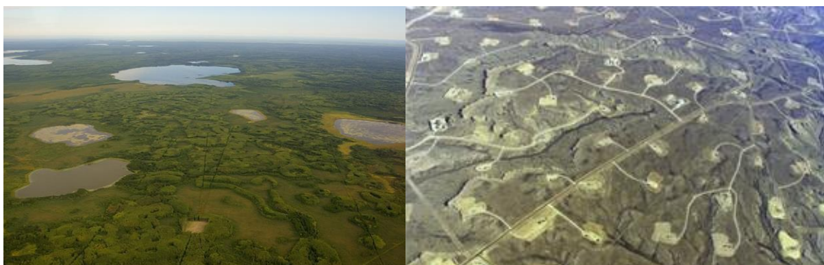
Figure 1. Left: Seismic testing lines through the northern Canadian boreal forest. Right: Fracking site in Wyoming, USA. The form is suburban, but each station is toxic and bare of life.

Urbanity organizes the land for specific tasks in terms of attributes. This is as simple as slopes for drainage or for collection of water, limits for erosion and vehicular movement, lakes to sequester toxic materials, or proximity to transport and economically derived centres. The issue is in how these are thought in light of need and context. Urbanizing structures include industrial farming to harness nature ever more deeply, 'enframing' nature, using Heidegger/Lovitt's term, according to technological production values, based on that isolate answerable questions in terms of problems and solutions. Urban systems overlay the natural environment. Urban structures appear as cuts and deformation in a natural setting, appearing as damage in most cases. Figure 1. Urbanized intensities and intensively farmed areas cause profound diminishment of life. We do not often experience the urban as such in a natural or rural setting. Figure 1. Nevertheless, we all feel the quality of rurality. Rurality suggests a threshold to how its qualities will absorb ubiquitous urbanity of technological processes that dismember nature's metabolism.