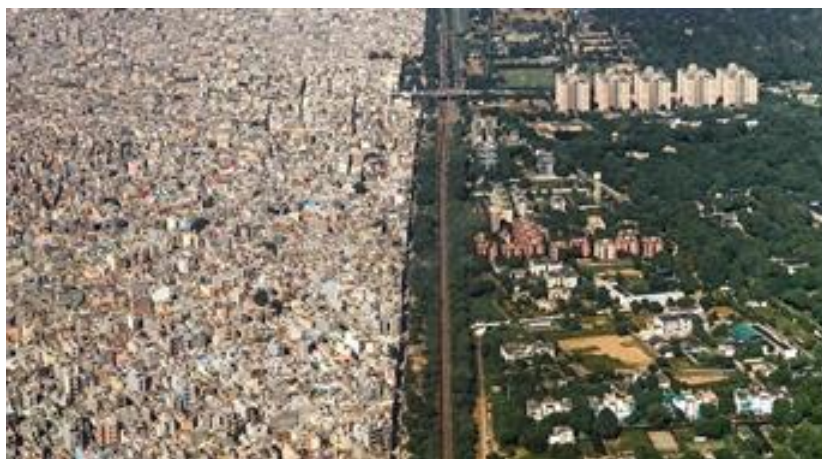
Figure 6. Palam Colony – Raj Nagar and Sadh Nagar, Delhi, India

Low environmental quality is a direct result of goals other than well-being. The argument is that if we increase wealth and technological efficacy, we will also increase wellbeing. It is unfortunate to have to recognize that these are circumstantial targets have no obligation to result in well-being, so they have not. The growth of difficulties that do not allow solutions by technical means is becoming undeniable. Climate change, which has not seen any significant remedial results over decades of producing initiatives and agreements, is one of these. Another is the entrenched slums in countries such as India where the development of wealth depends on the very poor. Claims of removing and reducing slums are ongoing, whereas they have only grown. The occasional eradication of a slum is most often like pest removal that only demonstrates the powerlessness of those people, rarely betterment. See Figure 6.