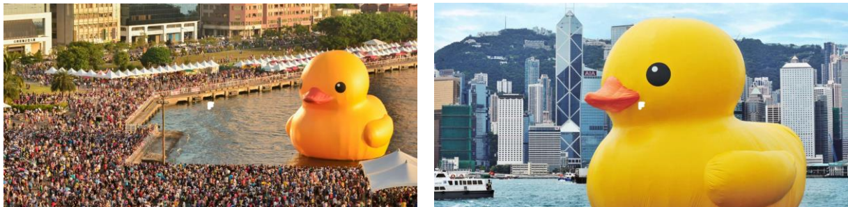
Figur 1. Rubber Duck Project ( https://florentijnhofman.com/ )

To date, tactical urbanism has been mainly adopted in Western countries such as Germany, the United Kingdom and the United States (Lydon, Bartman, Garcia, Preston & Woudstra, 2012; Douglas, 2020). Overseas, the application of this approach has brought about positive effects. In Korea, however, South Korea still lacks awareness of tactical urbanism, and case analysis and research for policy proposals have been mainly carried out so far. In addition, tactical urbanism has yet to be applied often in domestic urban regeneration projects, and few studies have verified its effectiveness in Korea. Against this backdrop, it is necessary to conduct an empirical analysis of its current state and effectiveness. The purpose of this study is to analyze the impact of tactical urbanism applied in Seoul on the formative factors of placeness and change in perception of placeness.