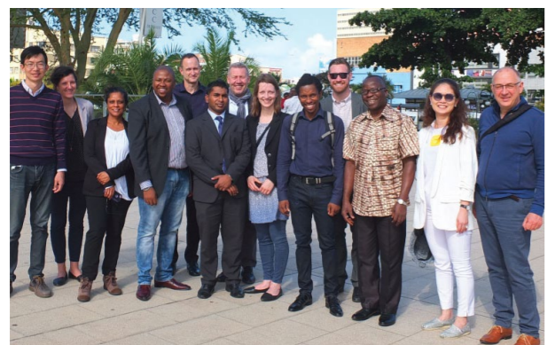
Financial cooperation models for urban transformation Durban - SOUTH AFRICA

The goal of UPATs is to mobilise the extensive planning expertise of ISOCARP members in order to assist cities and regions with their projects, programmes, and policies on spatial planning, urban design and placemaking. UPATs are organised on demand, comprising both senior and junior planners, and they present their advice in a dedicated report and/or Plan Magazine.