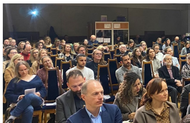
International Conference Gdańsk - Poland

We have implemented international small-scale events to address issues at a local level.