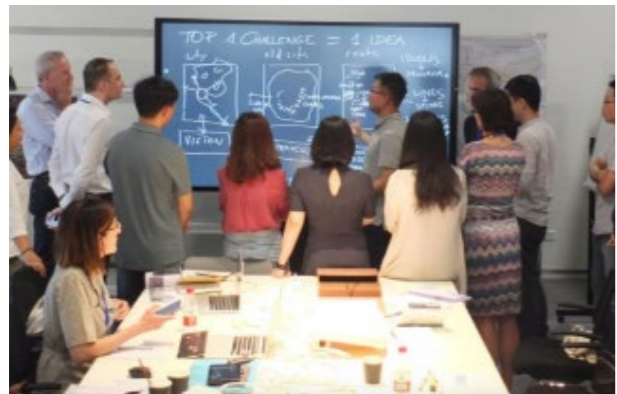
Revitalisation of the heritage area Guangzhou - CHINA