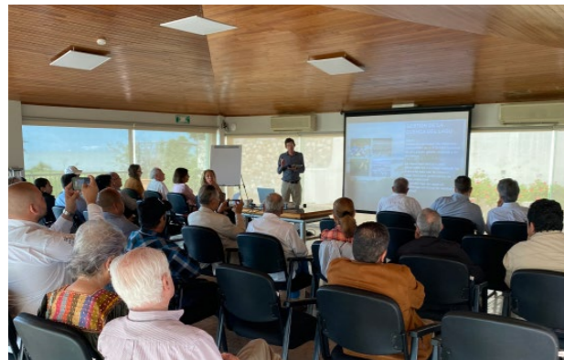
Design Planning Workshop Ribera de Chapala - Mexico