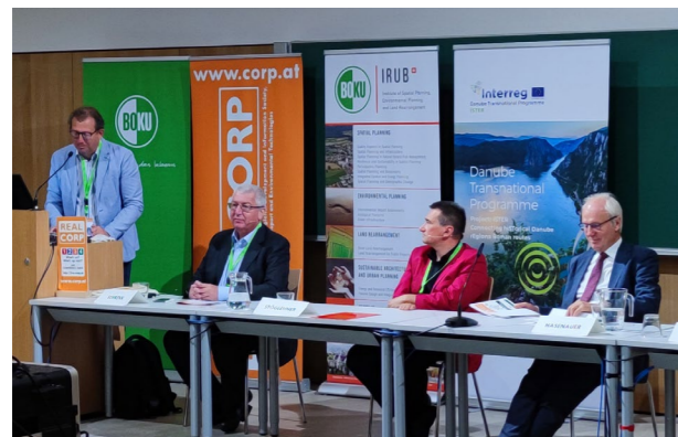
International Regional Event #1 Vienna - Austria