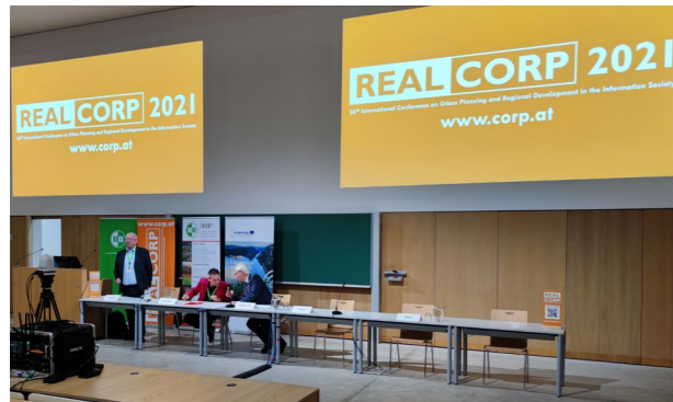
International Regional Event #1 Vienna - Austria