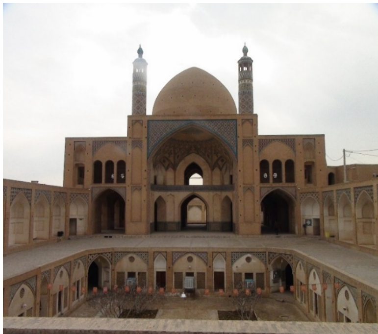
Figure 7. The courtyard of Agha Bozarg mosque in Kashan city

this space is a semi opened between courtyard and Shabestan. The history of it goes back to Iranian architecture in Ashkanian and Sasanid era.