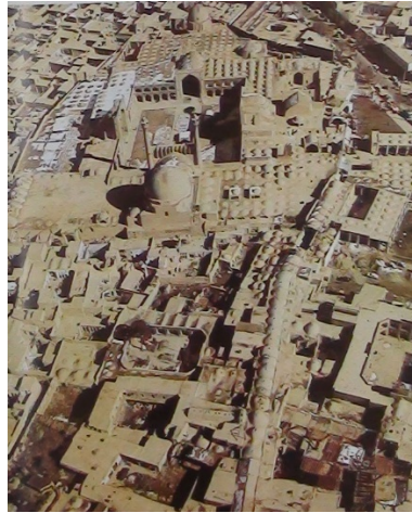
Figure 3. Roofscape of Jameh mosque of Isfahan

It is the scape of roofs which can be seen from higher buildings or other high places. Roofscape needs to be decorated to form a remarkable and noticeable city.