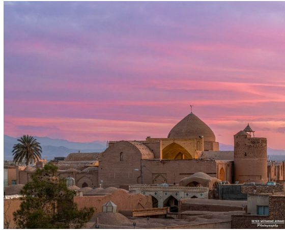
Figure 1. Jameh mosque (great mosque) in Ardestan city

The skyline can be defined as “a line which exists in the intersection of sky and land”. The skyline is the crown of the city and this crown will be decorated by gems which they are actually the land marks. With putting more gems with a good order on the crown, we can have more beautiful cityscape and skyline in the city. Skyline can create an individual and unique character in the city.