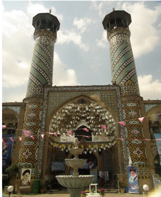
Figure 5. Imam Mosque in Bazar of Tehran

The entrance of a mosque includes entry, the minaret above the entry, the door, stone bench, Hashti and corridor. The entrance of the mosque usually is decorated with tile work and plastering.