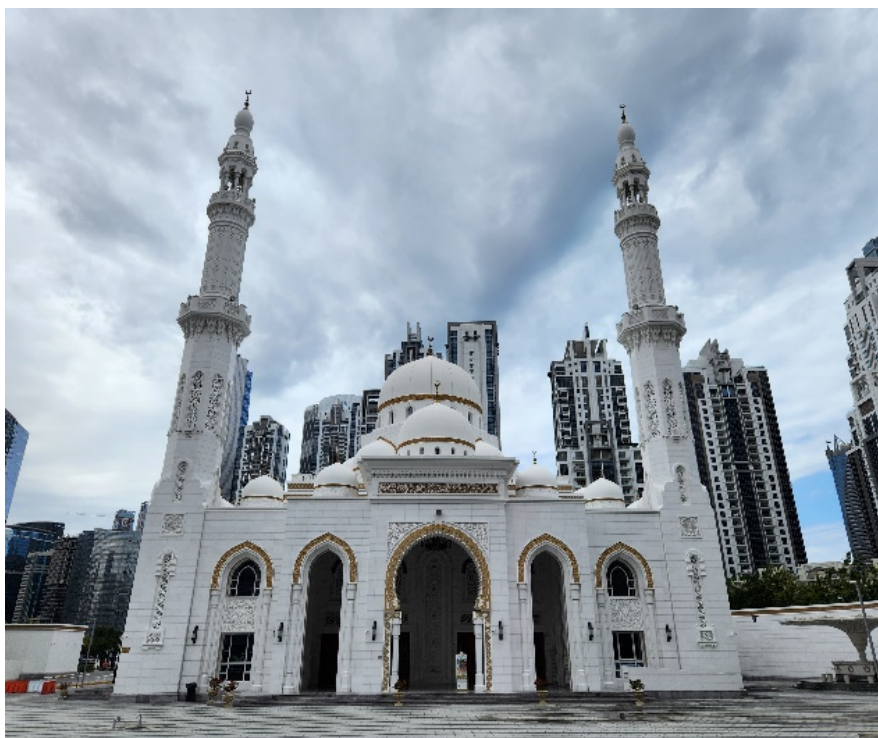
Figure 16. A district mosque in Dubai

Even smaller mosques have their effect in the image of city in smaller scale. Presenting a good image of district mosques can improve the image of that district of city.