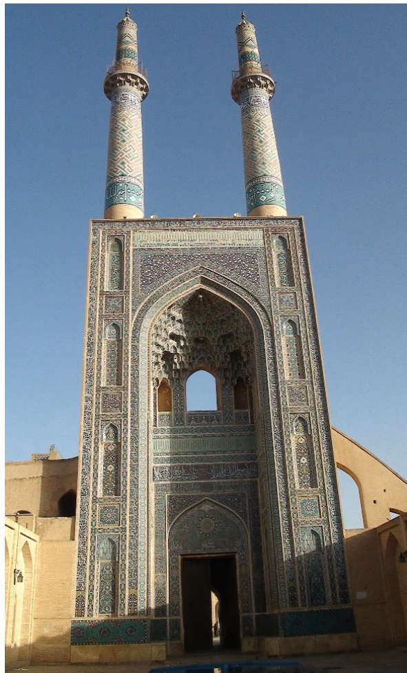
Figure 9. Jameh mosque in Yazd city