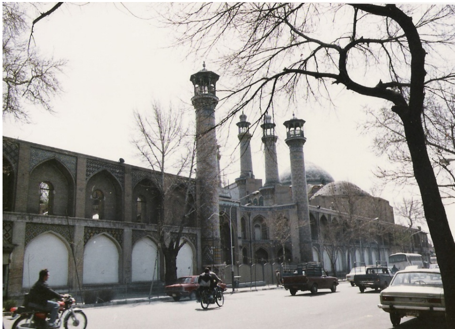
Figure 8. Sepahsalar Mosque in Tehran