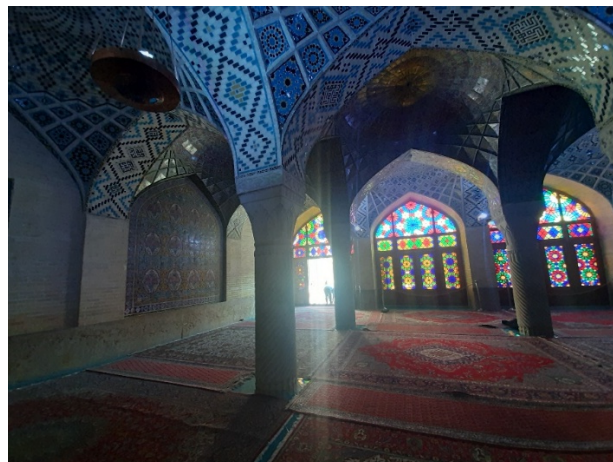
Figure 12. Shabestan of Nasir-ol-Mulk Mosque in Shiraz

a covered hall with numerous columns in mosque and it is the main space for praying and meeting.