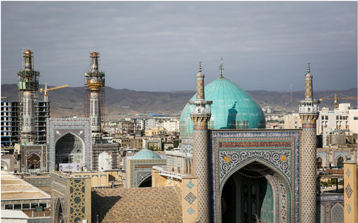
Figure 17. Goharshad mosque in Mashad city

Finally, it can be said that providing three-dimensional plan for Iranian cities with considering important landmarks specially mosques can create a more considerable and noticeable cities.