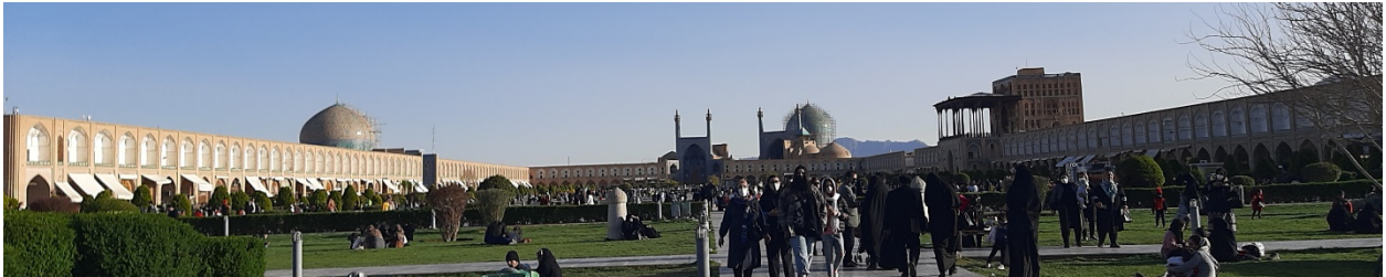
Figure 4. Naghshe – Jahan square roofline

The difference between skyline and roofline is that skyline can be seen from a long distance and roofline can be seen from the inside the urban space. So, we can see the roofline from the near distance.