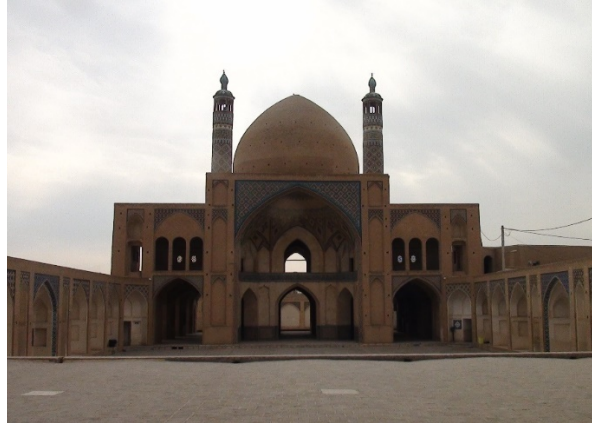
Figure 10. Agha Bozorgh Mosque in Kashan

it is an arched structure of the roof of mosques which can be identified as a landmark like minaret. Many Doods in mosques have been decorated by tiling.