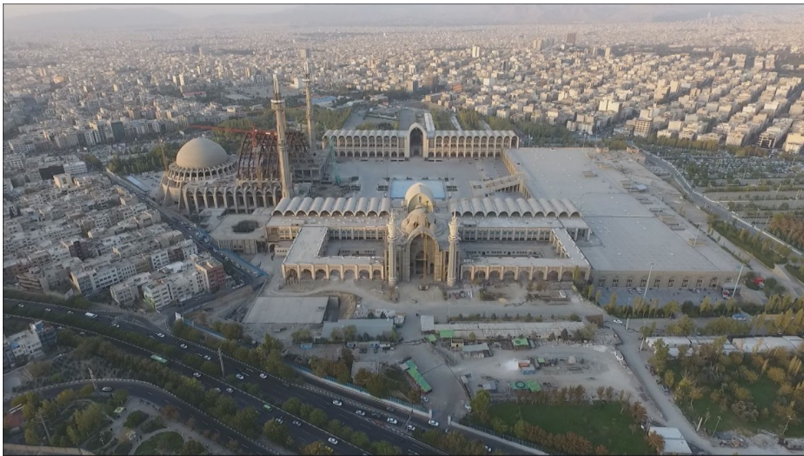
Figure 13. Mosalla (mosque for doing ceremonial prayers) of Tehran

We have good example of this kind in some Iranian cities and this should be improved in other Iranian cities. During the making shape of the city this landmark can enrich the physical impact of Iranian cities.