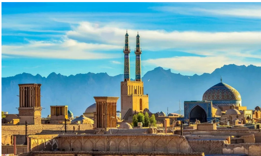
Figure 2. The skyline of historical city of Yazd