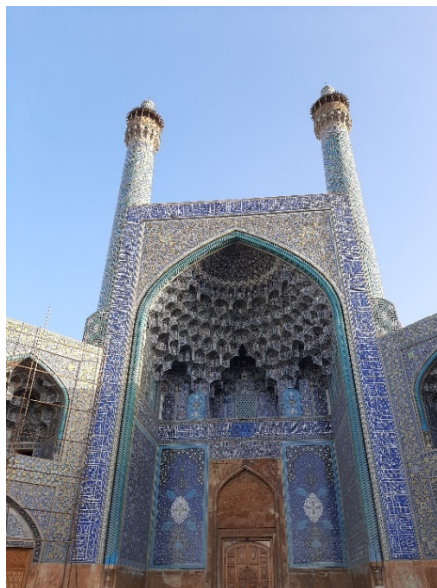
Figure 6. Imam mosque in Isfahan