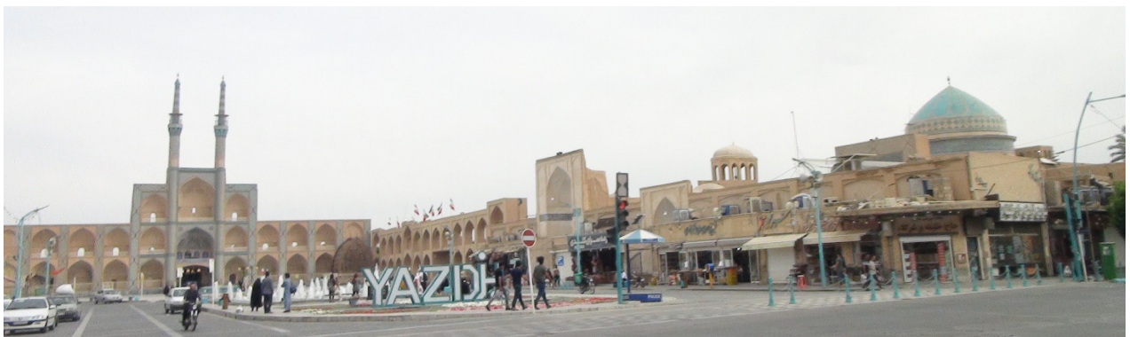
Figure 14. Roofline of the square of Amir Chaghmagh in Yazd city

Istanbul in Turkey is a good and noticeable example of it. This city has the beautiful image because of its Mosques.