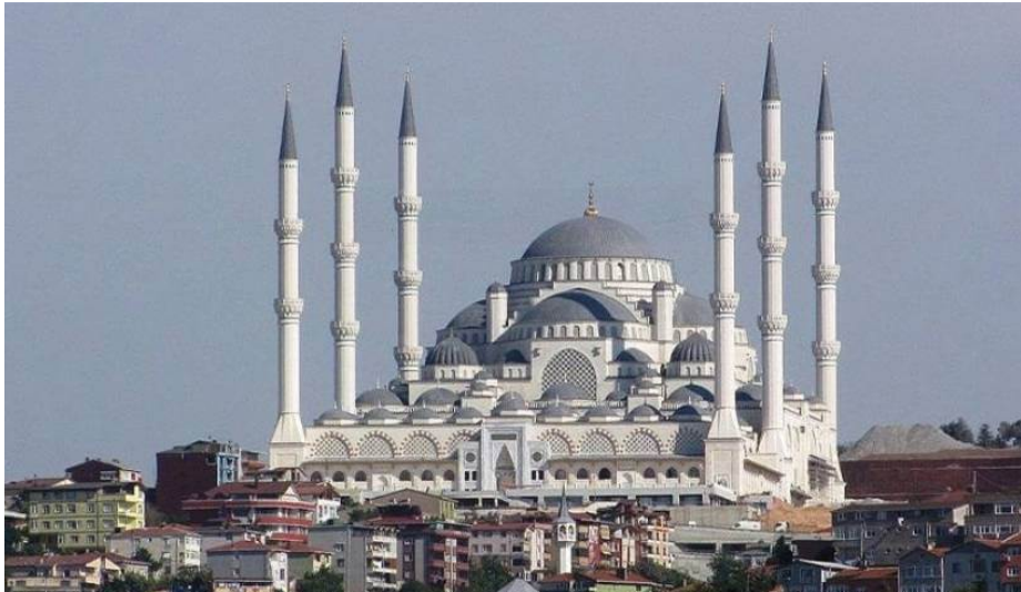
Figure 15. Roofline in Istanbul

Even smaller mosques have their effect in the image of city in smaller scale. Presenting a good image of district mosques can improve the image of that district of city.